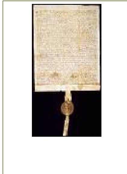
MAGNA CARTA sells for 21.3 Million