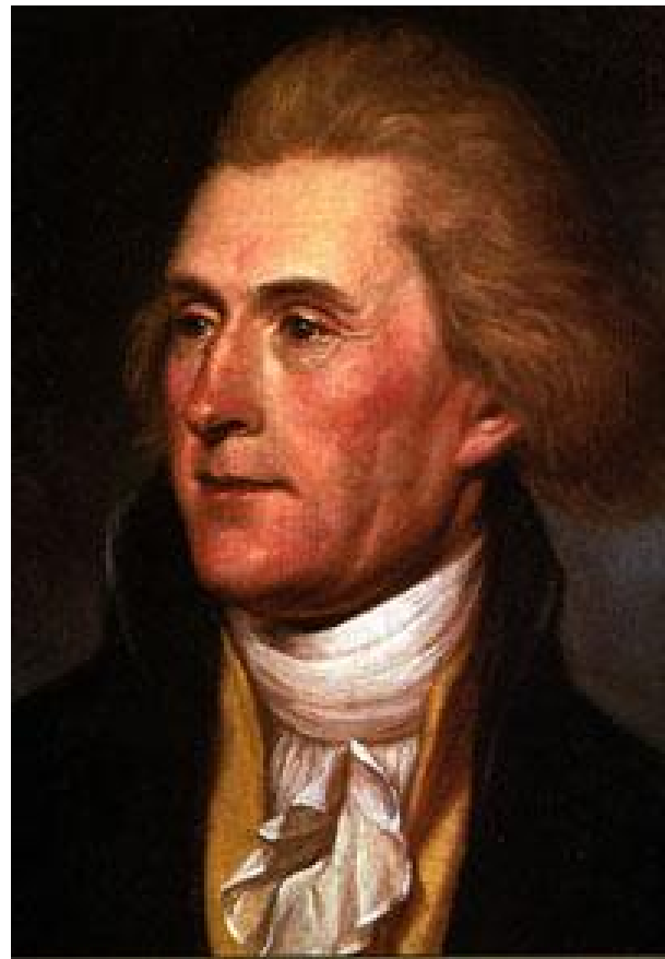
Thomas Jefferson was the principal author of the Declaration

We, therefore, the Representatives of the united States of America, in General Congress, Assembled, appealing to the Supreme Judge of the world for the rectitude of our intentions, do, in the Name, and by Authority of the good People of these Colonies, solemnly publish and declare, That these united Colonies are, and of Right ought to be Free and Independent States; that they are Absolved from all Allegiance to the British Crown, and that all political connection between them and the State of Great Britain, is and ought to be totally dissolved; and that as Free and Independent States, they have full Power to levy War, conclude Peace, contract Alliances, establish Commerce, and to do all other Acts and Things which Independent States may of right do. And for the support of this Declaration, with a firm reliance on the protection of divine Providence, we mutually pledge to each other our Lives, our Fortunes and our sacred Honor.