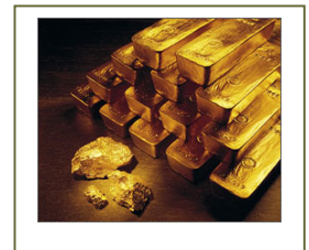
Gold Bars and nuggets

"We stand to make as much or better and sleep at night instead of going to jail," he said